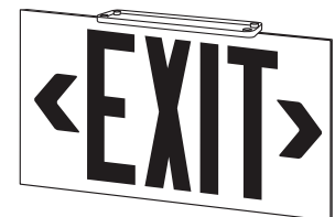
Ceiling Mount Option