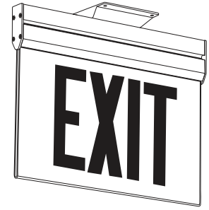
Acrylic Framing System Ceiling Mount