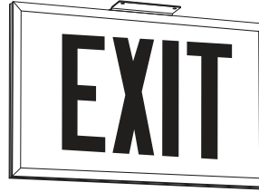
Aluminum Framing System Ceiling Mount