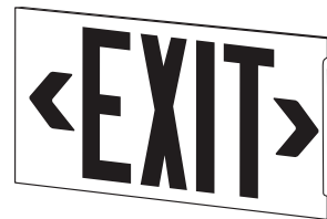
Flag Mount Option