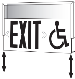
Faceplate(s) slide out for quick and easy installation.

The design of the ML-STX-HE exit provides a clean and attractive appearance. The 20 gauge steel frame contains no external holes or slots adding to the clean look while eliminating unwanted light leaks, can be securely mounted in any application. The face and back plates are mounted into the frame using a channel system that permits simple and speedy removal during installation.